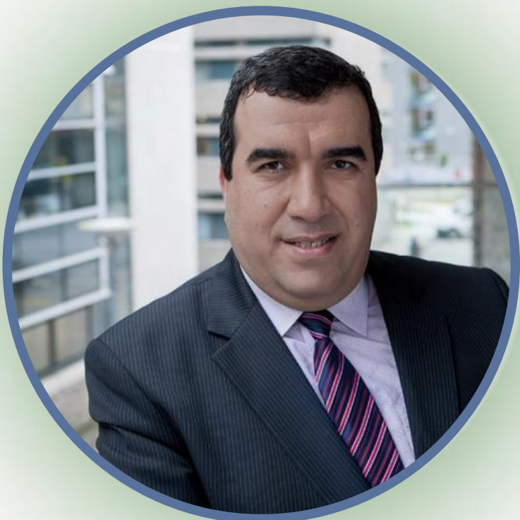
Pr. Khaled HUSSAINEY